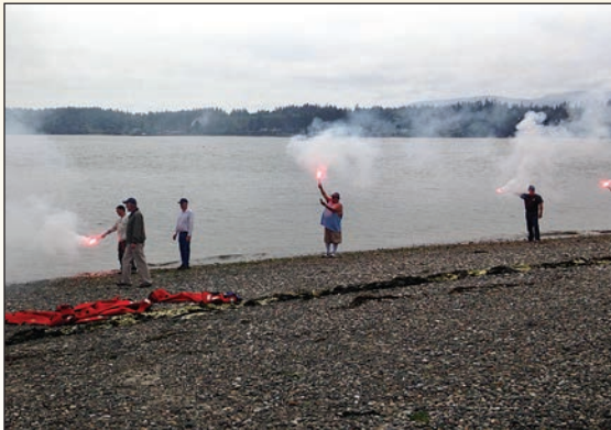
Lummi divers get hands-on practice with safety flares.